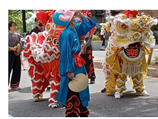
Left to Right: Fall Fest with Reade Street Prep; Free the Curls book distribution at NYCHA Baby Shower in the Bronx; AAPI History Day in Jackson Heights with AAFE